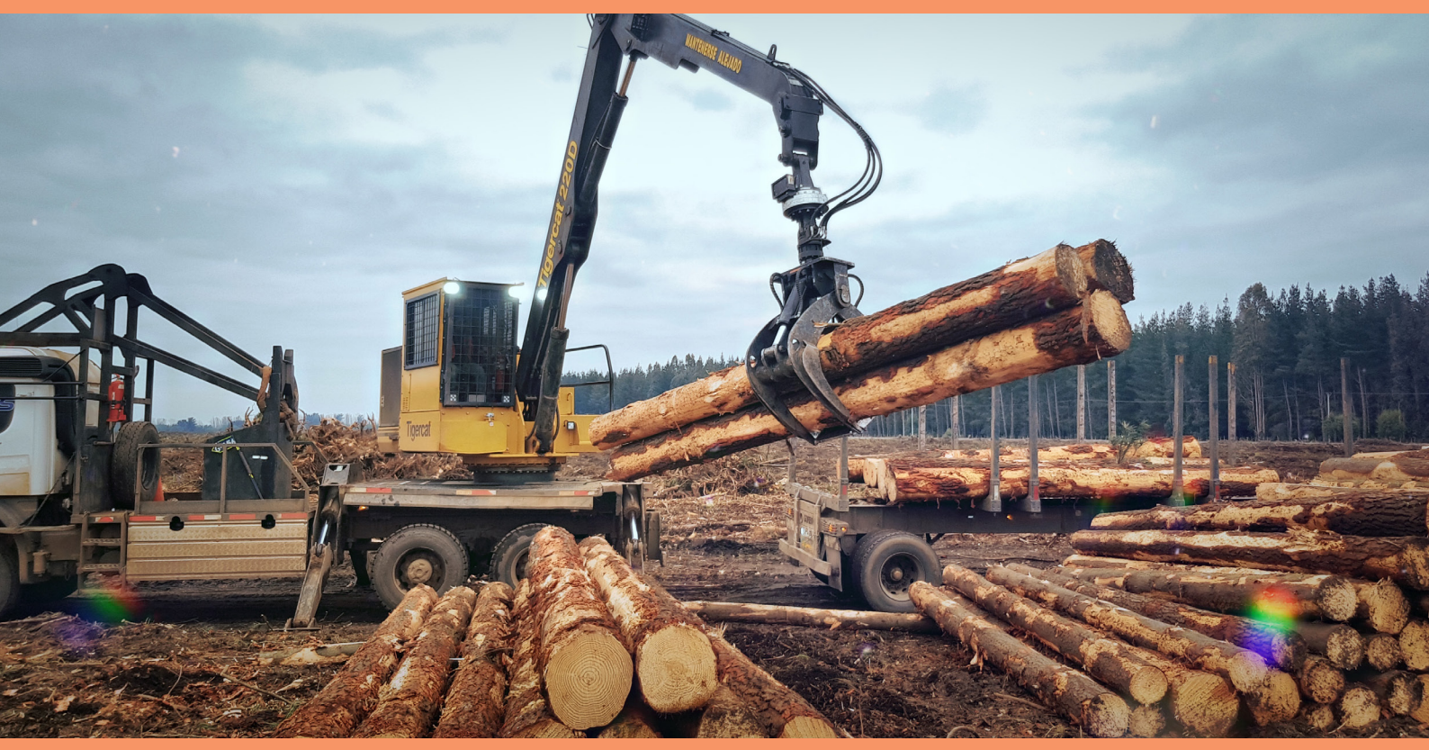
Intermercato is not only grapples - Explore our complete range of products on www.intermercato.com, or contact our proficient sales team.