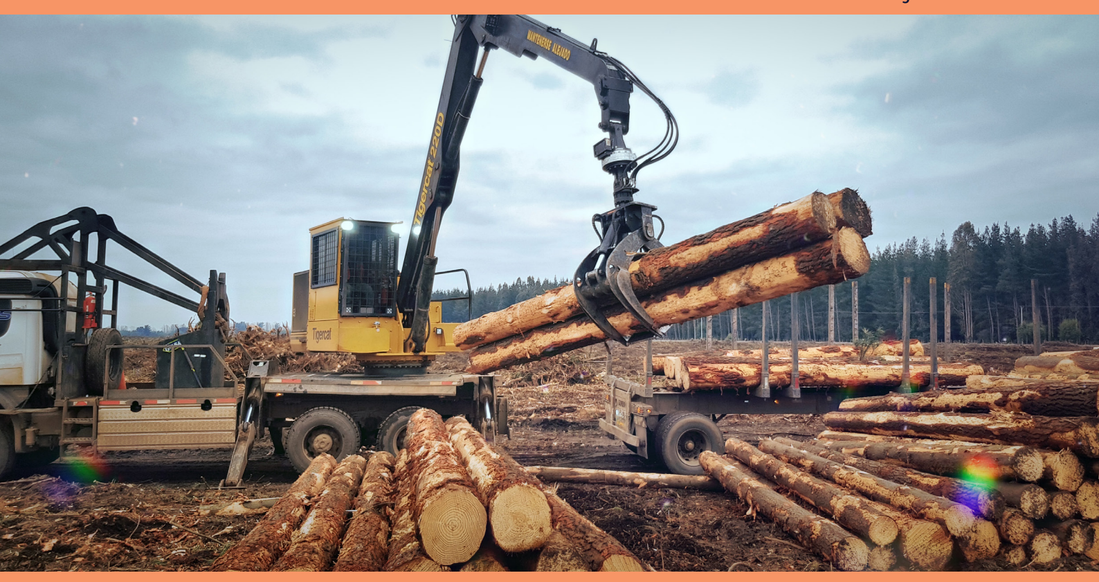
Intermercato is not only grapples - Explore our complete range of products on www.intermercato.com, or contact our highly skilled sales

Recommended machine weight and crane size